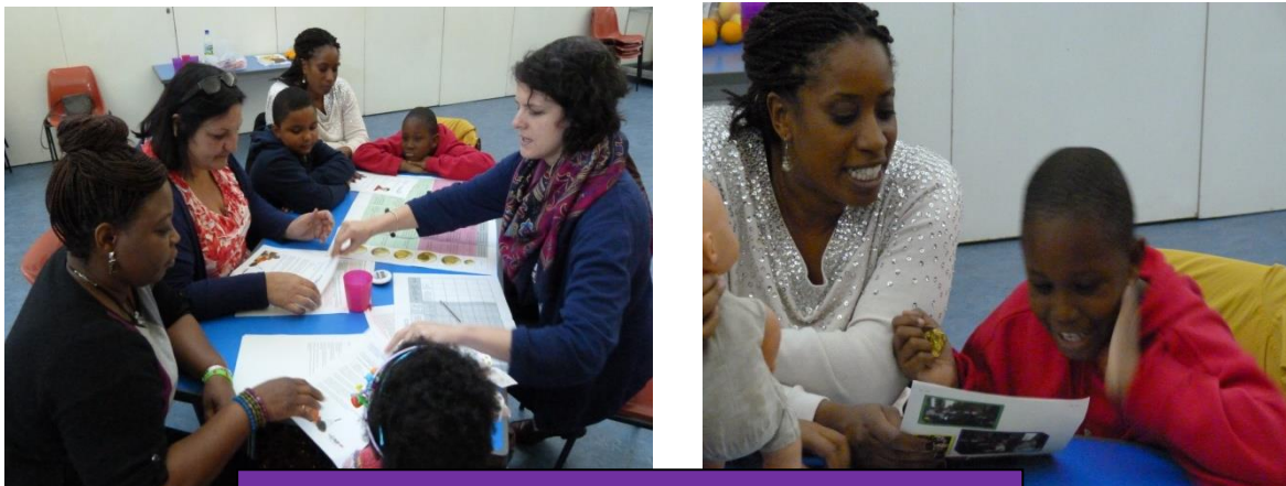
Members of the LPCF take part in consultations